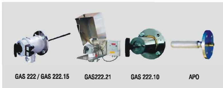
GAS 222 / GAS 222.15