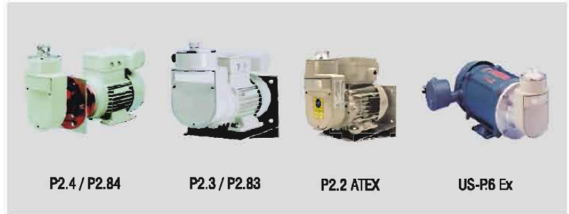
P2.4 / P2.84